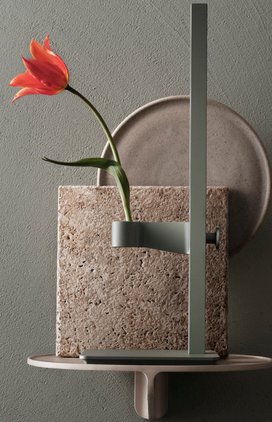
Museum Candle holder. Material: Powder coated aluminium and steel. Colours: White, Green, Dark Brown. Dimensions: W13 cm, D15 cm, H40 cm. Adjustable height between 3.5 and 35.5 cm.