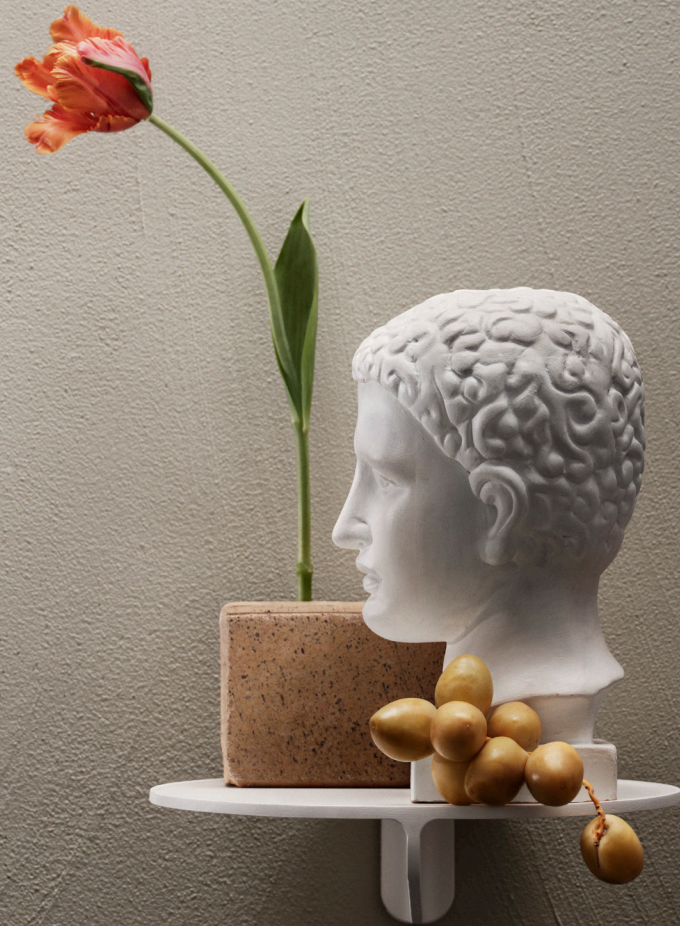
NM&.045 Console shelf. Material: Powder coated aluminium. Colours: Aluminium, White, Dark Brown, Beige and Orange. Dimensions: W28 cm, D24 cm, H8 cm. 10 kg centred load.