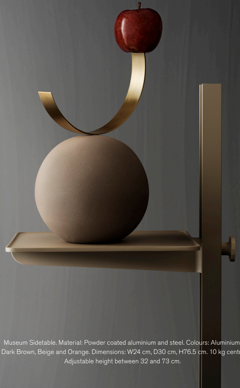
Museum Sidetable. Material: Powder coated aluminium and steel. Colours: Aluminium, White, Dark Brown, Beige and Orange. Dimensions: W24 cm, D30 cm, H76.5 cm. 10 kg centred load. Adjustable height between 32 and 73 cm.