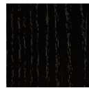
BLACK ASH, FSC MIX 70%